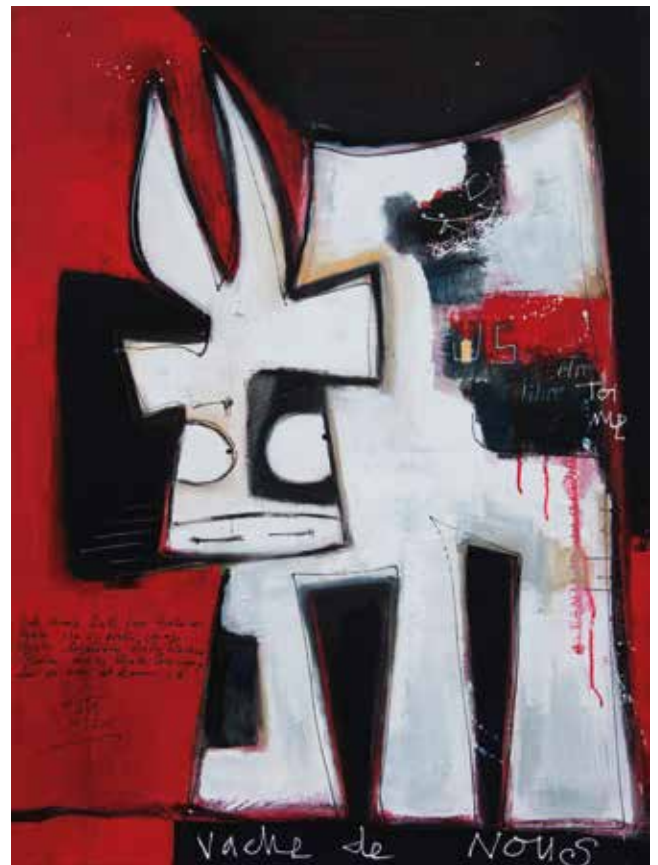
Vache de® Nous, painting, 65x50cm,2016

My creations are now presented the world over, as the result of my long artistic path. Much like a first album, this success have its owns limits.