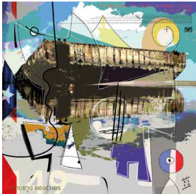
Vache de® Landing, digital art, 2020