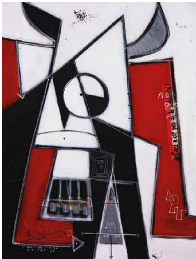
Vache de® Exception, painting, 65x50cm, 2016