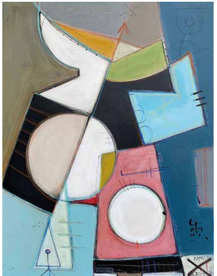
Vache de® Crédo, painting, 116x89cm, 2020