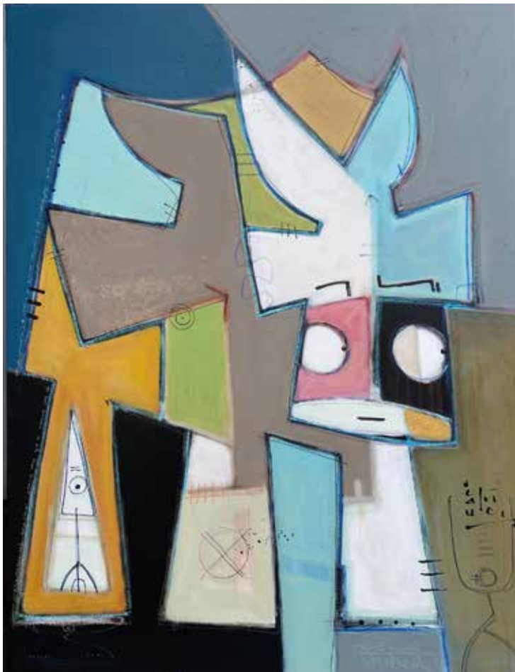
Vache de® Décor, painting, 116x89cm,2020